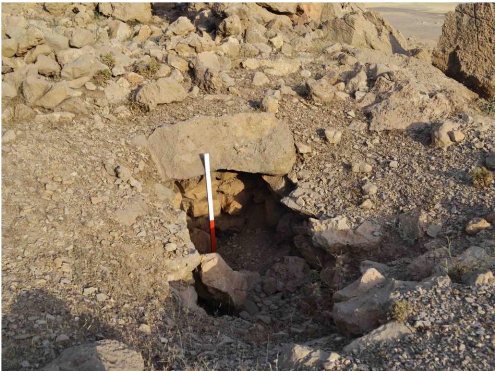
Fig. 8. The visible structure of one of the tombs in Qaleh Bahadori A cemetery