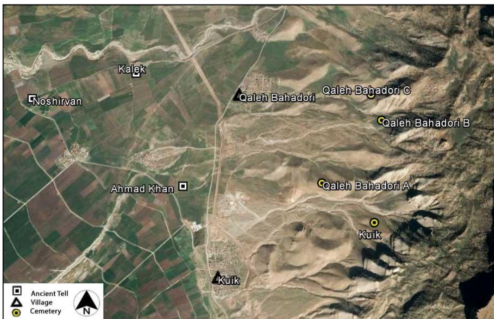
Fig. 9. Locations of the cemeteries and archaeological Tells near the Qaleh Bahadori and Kuik villages