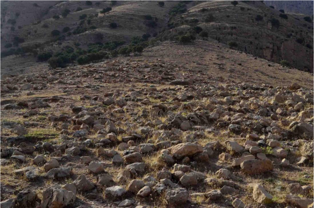
Fig. 3. The area of Kuik cemetery 13