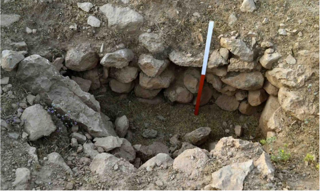
Fig. 5. One of the plundered tombs of Qaleh Bahadori A cemetery