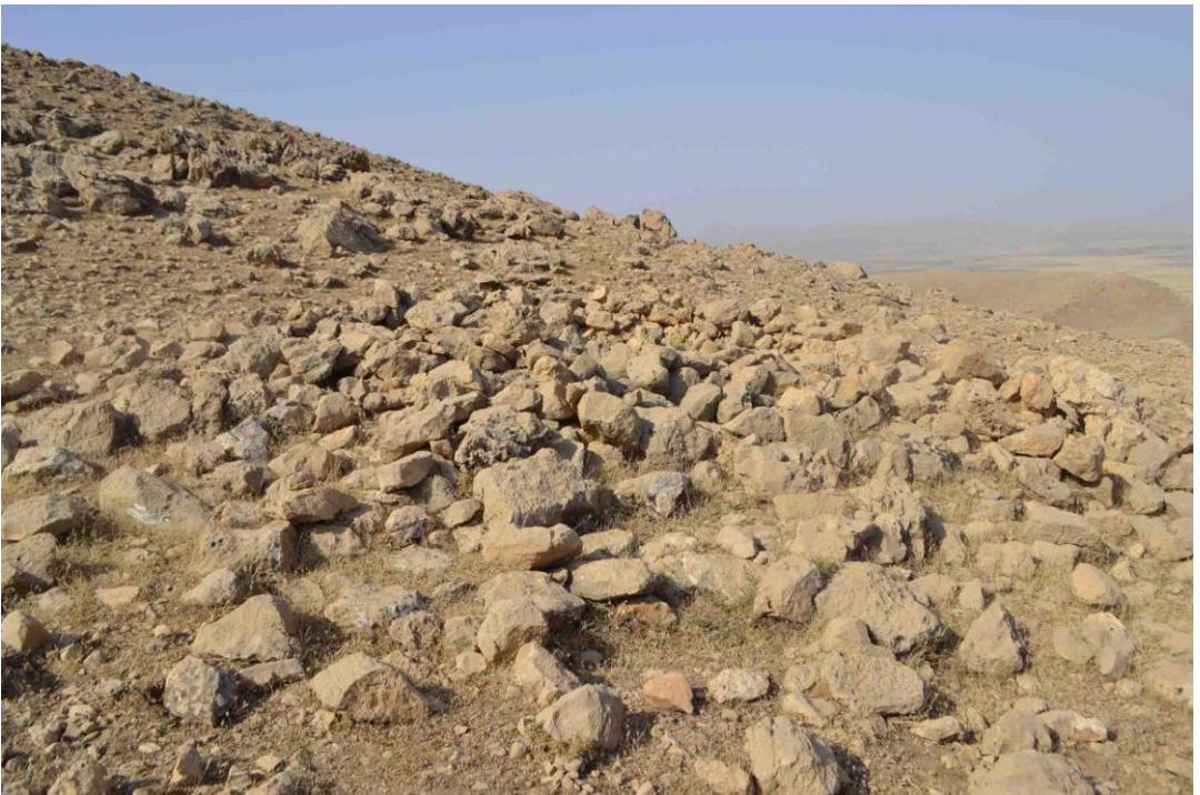
Fig. 6. The area of Qaleh Bahadori B cemetery