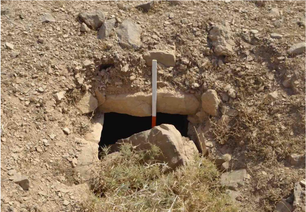
Fig. 7. An example of a plundered tomb in Qaleh Bahadori C cemetery