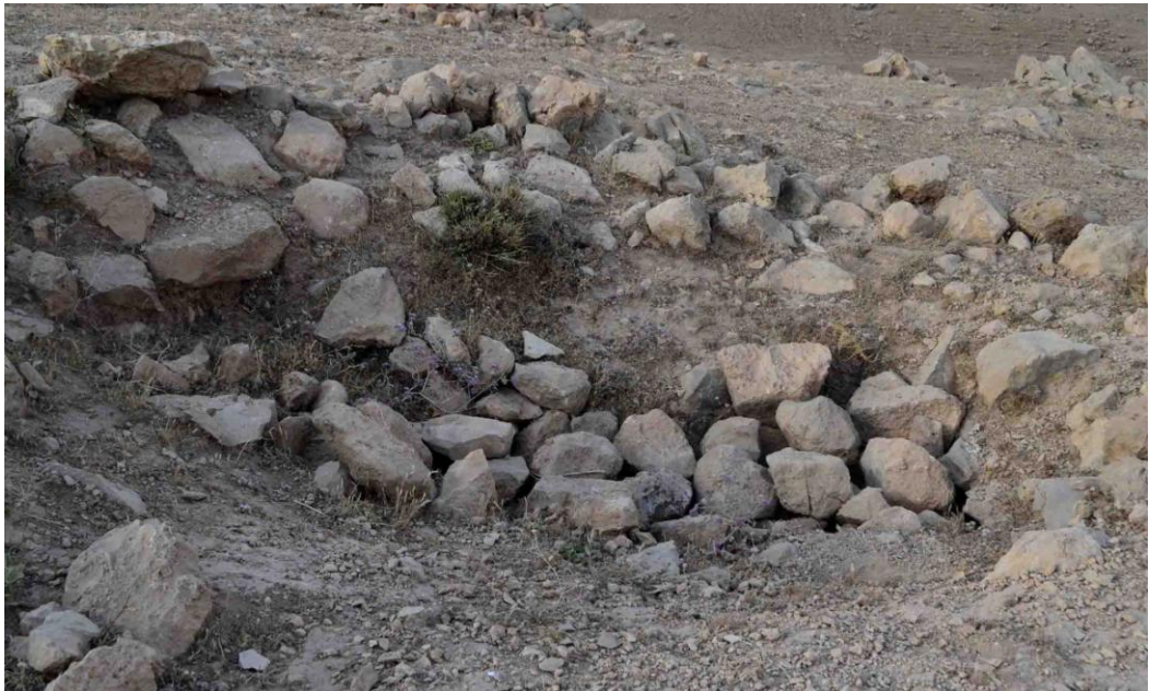
Fig. 4. A tomb in Qaleh Bahadori A cemetery which had been filled after looting