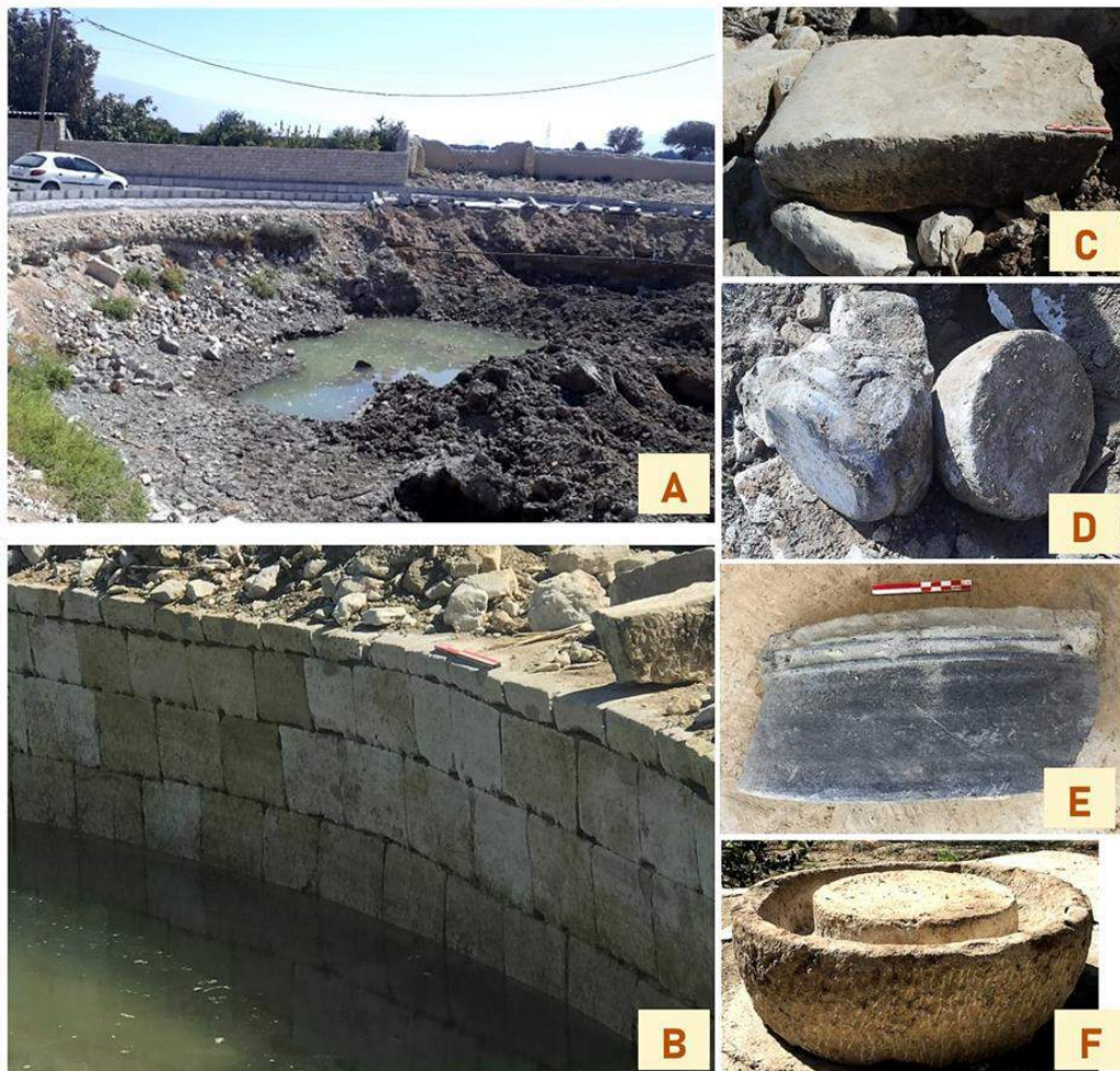
Fig. 3. The Dehbarm pond structure and mentioned finds (photo by A. Askari Chaverdi, summer 2021; illustrated by E. Rashidian)

under the modern village. The outlet is regular in shape and about 2.5 m wide. Currently, less than 100 m of it is visible on the surface.